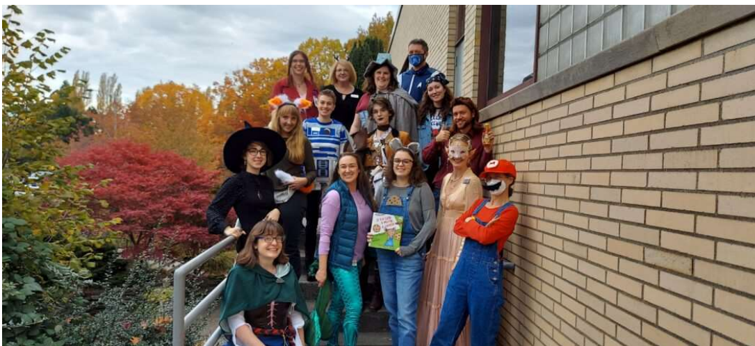
BPL Staff at Halloween

Reaching the end of the year is often bittersweet – it's hard to believe the time has passed, but it's wonderful to reflect on all of the year's adventures and accomplishments. Please join us for a look back at Bellingham Public Library 2022 Highlights, from services to Top 10 materials checked out.